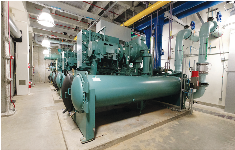
Central Energy Plant interior equipment, 2016

Powered by natural gas, the CTG has a capacity to produce up to 4.4 megawatts of electricity, which is more than the hospital's current need of about 3.2 megawatts. In addition to electrical power, the 52-ton CTG produces heat that is converted to steam used to operate medical equipment, space heating and air conditioning, plus it provides hot and cold water to the hospital. Also inside the CEP are boilers, chillers, cooling towers and auxiliary systems. It has a state-of-the-art control room that monitors the heating and refrigeration equipment, medical air and vacuum pumps. The hospital typically consumes about 2.3 million kilowatt hours per month. In comparison, SDG&E says the average household uses about 500 kilowatt hours in a 30-day period. The CEP was designed to allow for future growth and expansion of the hospital.