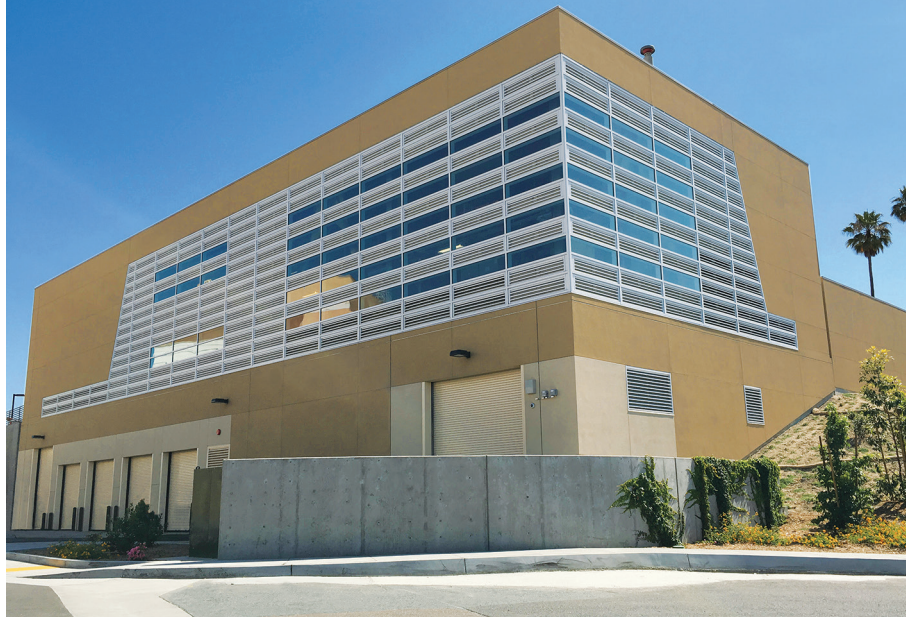
Central Energy Plant at Sharp Grossmont Hospital, 2016

Construction of the hospital's new, nearly $60 million Central Energy Plant (CEP) was completed in 2016. Following several months of equipment and systems testing and training for engineering staff, the CEP was declared to be fully operational and the hospital is now no longer solely reliant on the SDG&E power grid, generating nearly 100 percent of its electricity on site. For decades into the future, the new CEP will reduce the hospital's emission of greenhouse gas pollutants by 90 percent. Even in the event of an outage or other emergency, the hospital will continue to operate as needed. The three-story, 18,400-square-foot building, visible from the State Route 125 freeway on the southwest side of the hospital campus, also houses a new $14.6 million cogeneration system paid for by Sharp Grossmont Hospital as part of the continuing partnership for the hospital's operation and management under a lease agreement between GHD and Sharp HealthCare. The cogeneration system utilizes a combustion turbine generator (CTG), similar in function to a spinning engine on a passenger jetliner.