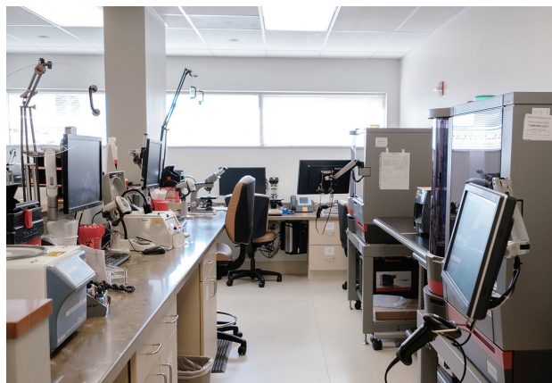
New H&V Center Laboratory opened and began serving patients in 2016

In March 2016, the H&V's new pharmacy and laboratory opened on Level "A" and began serving patients immediately. The H&V's new 6,700-square-foot pharmacy replaced the hospital's existing 3,100-square-foot pharmacy, which is now being used for other hospital purposes, including pathology, diagnostics and forensics. The new pharmacy also features a retail operation so that discharged patients can get prescriptions filled right at the hospital. It also provides extra space for research studies for patients needing investigational drug therapies. The H&V's new 13,000-square-foot laboratory replaced the hospital's existing 10,000-square-foot lab space. The new lab provides a smoother workflow resulting in greater capacity and a quicker turnaround time for specimen examination and processing.