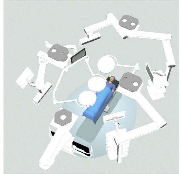
Multi-purpose procedural rooms within H&V Center Level 1 Surgery Floor build-out, expected for completion in 2018

In addition to the H&V Center, Prop G funds have been allocated for construction of the H&V's Level 1 Surgery Floor. The construction, referred to as a build-out, formally began in February 2017 following a Notice to Proceed to San Diego-based Swinerton Builders. The $10.2 million contract, awarded in December 2016, includes the construction of four new cardiac catheterization labs and four multi-purpose procedural rooms that will support a wide range of surgeries, including general, open-heart, minimally invasive and image-guided procedures, as well as various endovascular interventional surgeries. The $10.2 million contract is roughly $1.7 million below initial estimates for the construction. The project represents the final construction contract for voter-approved Prop G projects. The Grossmont Hospital Foundation has also raised funds for the equipment. Completion of construction is scheduled for Summer 2018. Licensing approval from the California Office of Statewide Health Planning and Development is expected to occur in late 2018. Simultaneously to the Prop G-financed H&V build-out construction, Sharp HealthCare is paying for additional H&V construction featuring eight new procedure rooms, including a post-anesthesia care unit (PACU). Completion of Sharp's in-fill construction is scheduled for 2019. When completed, the surgery floor will feature state-of-the-art medical equipment valued at more than $11 million.