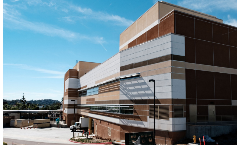
Heart & Vascular Center Exterior, 2017