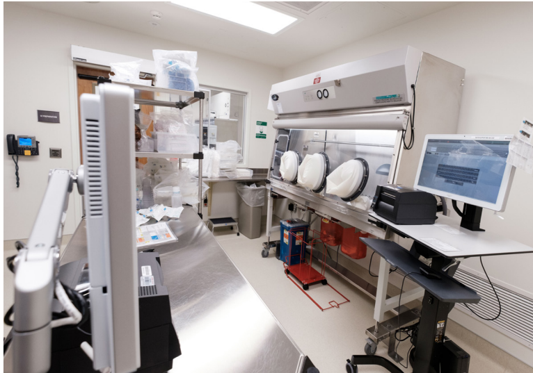
New H&V Center Pharmacy, opened and began serving patients in 2016

In addition to electrical power, the 52-ton CTG produces heat converted to steam which is used to operate medical equipment and provide space heating and air conditioning, as well as hot and cold water to the hospital. Powered by natural gas, the CTG has a capacity to produce up to 4.4 megawatts of electricity, more than the hospital's current need of about 3.2 megawatts. Inside of the new plant are boilers, chillers, cooling towers and auxiliary systems; it has a state-of-the-art control room that monitors the heating and refrigeration equipment, medical air and vacuum pumps. The CEP is changing the way the hospital functions as it supports new sustainable and cost-effective methods for everyday operations. This CEP was designed to allow for future growth and expansion of the hospital. By increasing efficiency, the CEP will undoubtedly increase the hospital's potential.